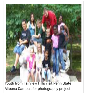
Youth from Fairview Hills visit Penn State Altoona Campus for photography project

and several faculty and staff resource persons agreed to participate in a variety week-long sessions devoted to one or another aspect of the creative arts, dance, poetry, theater, painting, and photography.